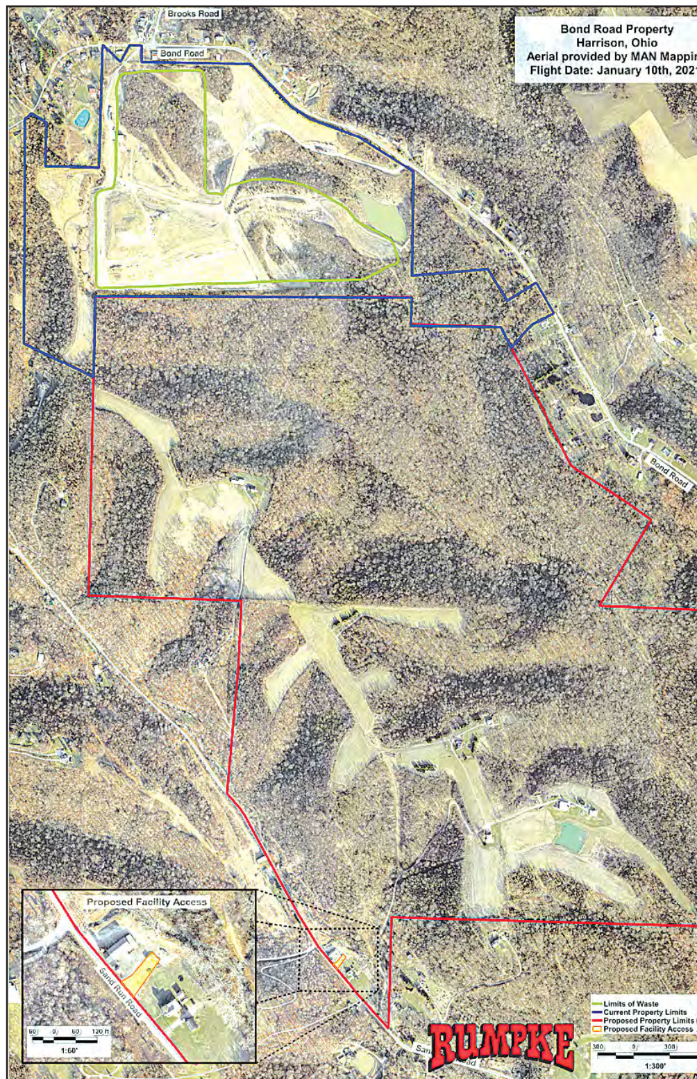
Rumpke recently purchased 466 acres of land in Whitewater Township. The new land is marked with a red line; the current land fill is drawn with a blue line.